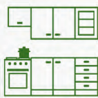
Kitchen cabinet & Countertop