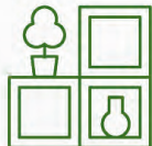
Other furniture applications